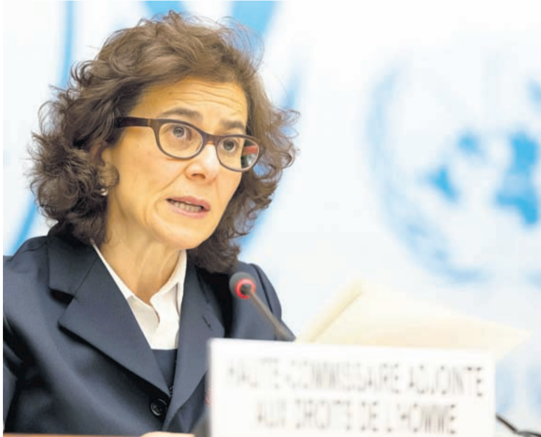
Nada Al-Nashif, UN Deputy High Commissioner for Human Rights, delivers her statement, during the Human Rights Council special session on "the grave human rights situation in Ethiopia", at the European headquarters of the United Nations in Geneva, Switzerland, Friday, Dec. 17, 2021.

Nearly 10 million people in northern Ethiopia face acute food insecurity, and at least 2 million have been forced to flee their homes. Humanitarian workers have little access and face hostility. Ethiopia's government has sought to restrict reporting on the war and detained some journalists, including a video freelancer accredited to The Associated Press, Amir Aman Kiyaro. Between 5,000 and 7,000 people swept up under Ethiopia's new state of